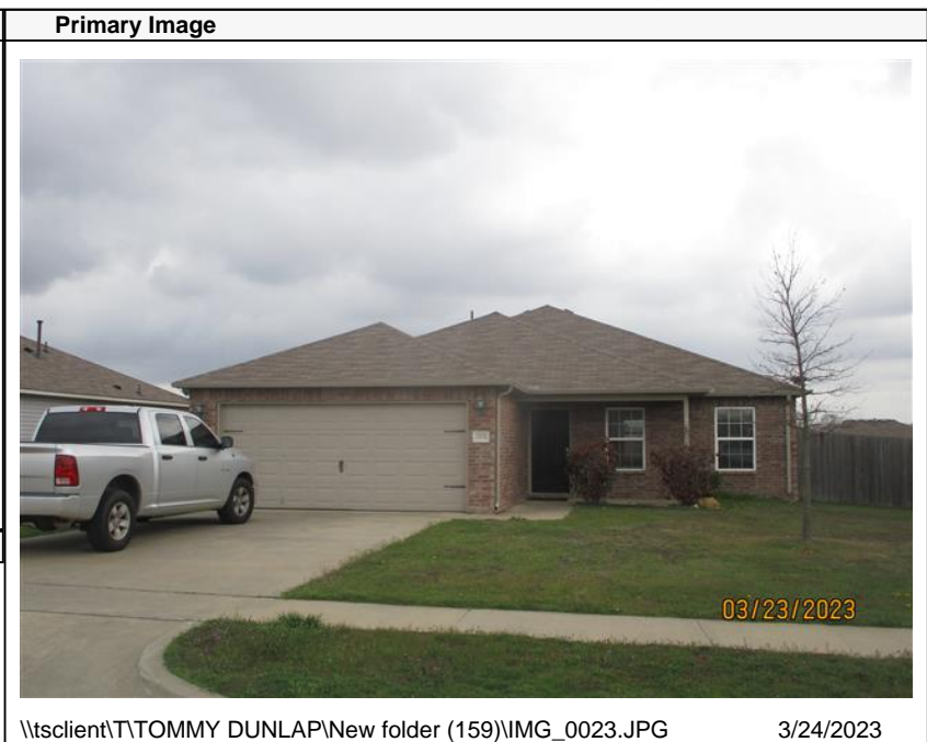
\\tsclient\T\TOMMY DUNLAP\New folder (159)\IMG_0023.JPG 3/24/2023