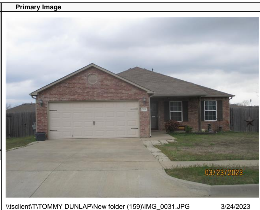
\\tsclient\T\TOMMY DUNLAP\New folder (159)\IMG_0031.JPG 3/24/2023