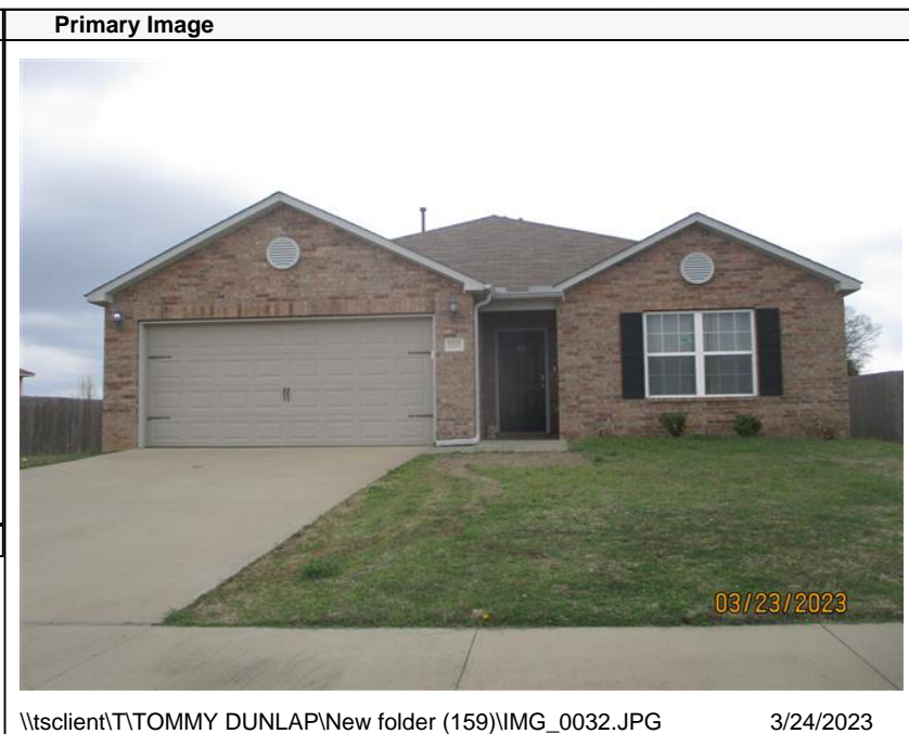
\\tsclient\T\TOMMY DUNLAP\New folder (159)\IMG_0032.JPG 3/24/2023