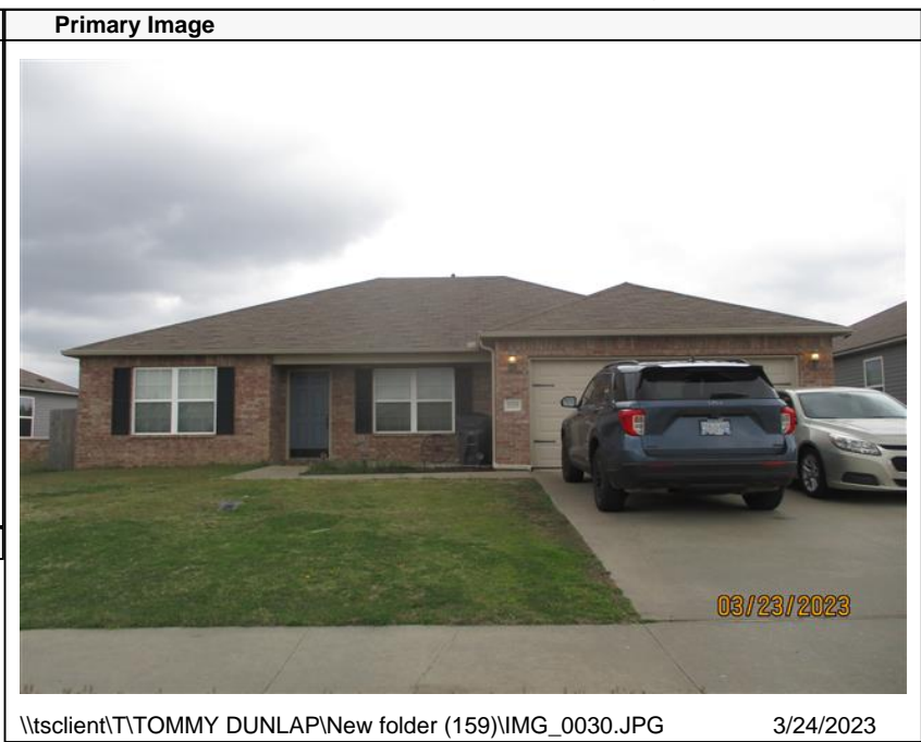
\\tsclient\T\TOMMY DUNLAP\New folder (159)\IMG_0030.JPG 3/24/2023