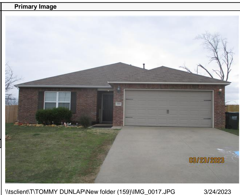
\\tsclient\T\TOMMY DUNLAP\New folder (159)\IMG_0017.JPG 3/24/2023