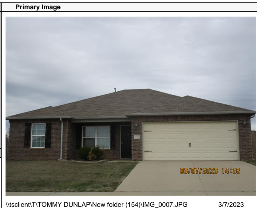
\\tsclient\T\TOMMY DUNLAP\New folder (154)\IMG_0007.JPG 3/7/2023