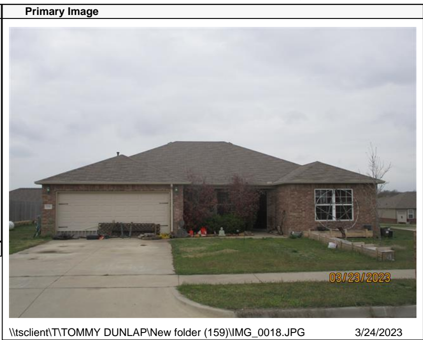
\\tsclient\T\TOMMY DUNLAP\New folder (159)\IMG_0018.JPG 3/24/2023