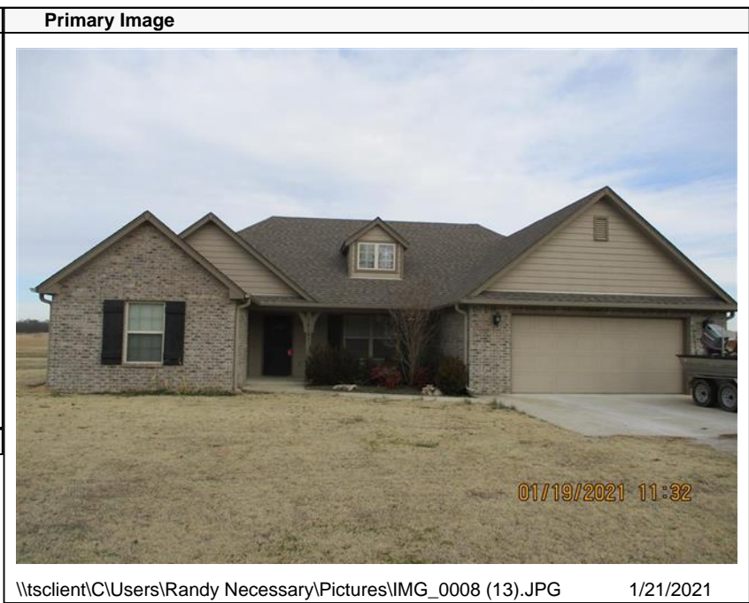
\\tsclient\C\Users\Randy Necessary\Pictures\IMG_0008 (13).JPG 1/21/2021