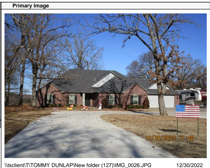
\\tsclient\T\TOMMY DUNLAP\New folder (127)\IMG_0026.JPG 12/30/2022