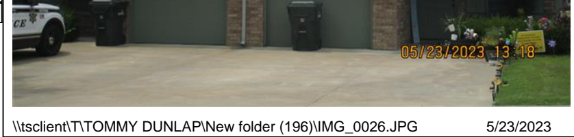
\\tsclient\T\TOMMY DUNLAP\New folder (196)\IMG_0026.JPG 5/23/2023