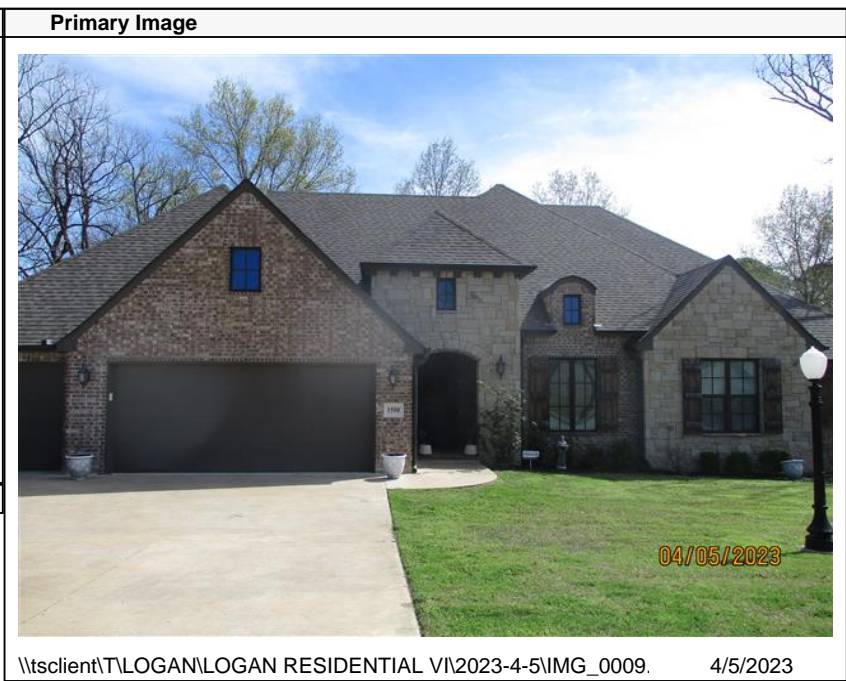
\\tsclient\T\LOGAN\LOGAN RESIDENTIAL VI\2023-4-5\IMG_0009. 4/5/2023