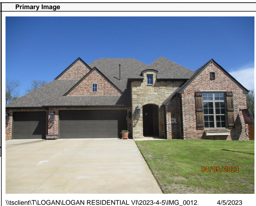
\\tsclient\T\LOGAN\LOGAN RESIDENTIAL VI\2023-4-5\IMG_0012. 4/5/2023