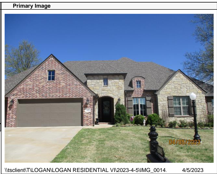
\\tsclient\T\LOGAN\LOGAN RESIDENTIAL VI\2023-4-5\IMG_0014. 4/5/2023