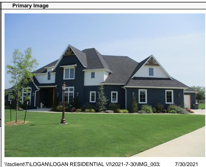
\\tsclient\T\LOGAN\LOGAN RESIDENTIAL VI\2021-7-30\IMG_003; 7/30/2021