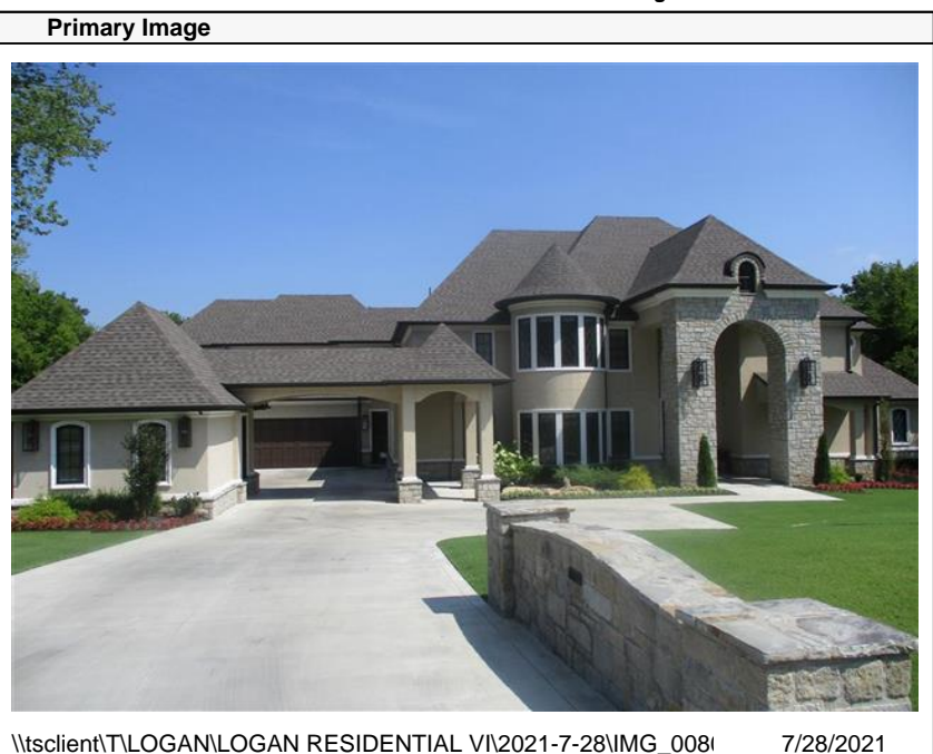
\\tsclient\T\LOGAN\LOGAN RESIDENTIAL VI\2021-7-28\IMG_008I 7/28/2021