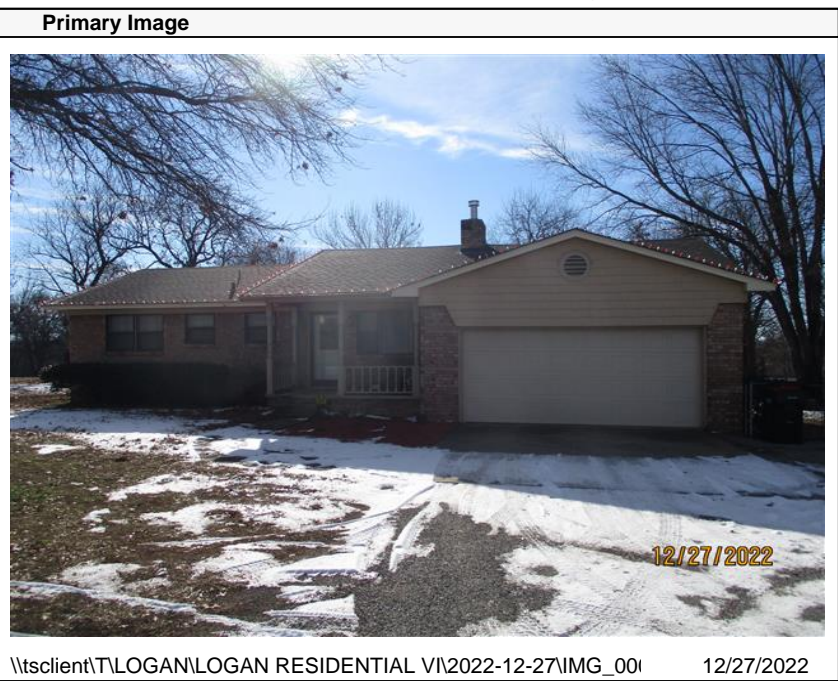
\\tsclient\T\LOGAN\LOGAN RESIDENTIAL VI\2022-12-27\IMG_001 12/27/2022