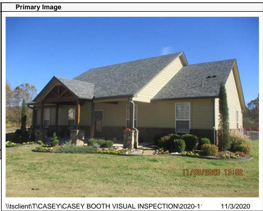
\\tsclient\TCASEY\CASEY BOOTH VISUAL INSPECTION\2020-1' 11/3/2020