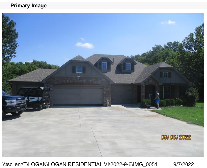
\\tsclient\T\LOGAN\LOGAN RESIDENTIAL VI\2022-9-6\IMG_0051. 9/7/2022