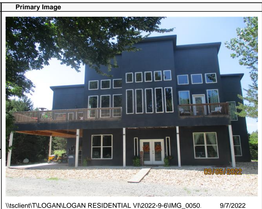
\\tsclient\T\LOGAN\LOGAN RESIDENTIAL VI\2022-9-6\IMG_0050. 9/7/2022