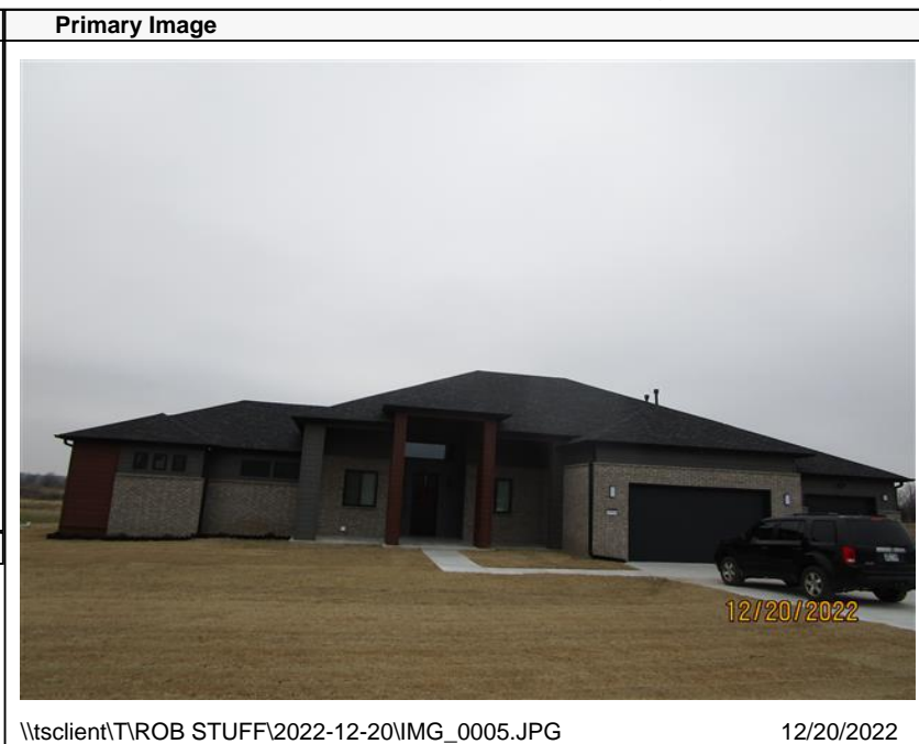
\\tsclient\T\ROB STUFF\2022-12-20\IMG_0005.JPG 12/20/2022