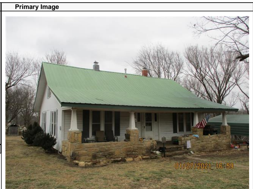
\\tsclient\C\Users\Randy Necessary\Pictures\IMG_0001 (17).JPG 1/27/2021