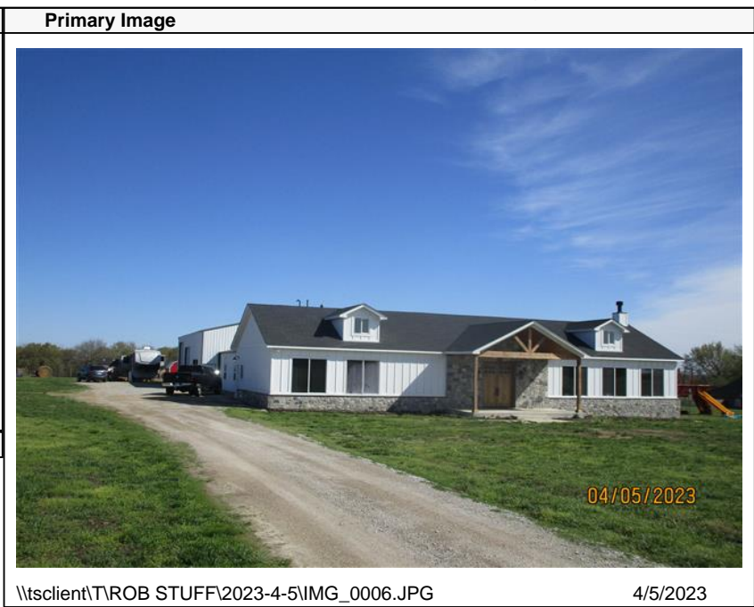
\\tsclient\T\ROB STUFF\2023-4-5\IMG_0006.JPG 4/5/2023