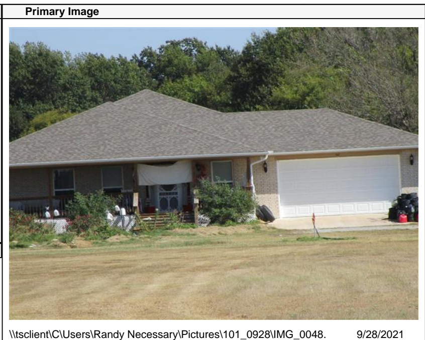
\\tsclient\C\Users\Randy Necessary\Pictures\101_0928\IMG_0048. 9/28/2021