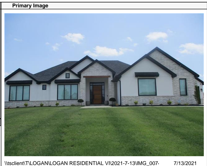
\\tsclient\T\LOGAN\LOGAN RESIDENTIAL VI\2021-7-13\IMG_007 7/13/2021