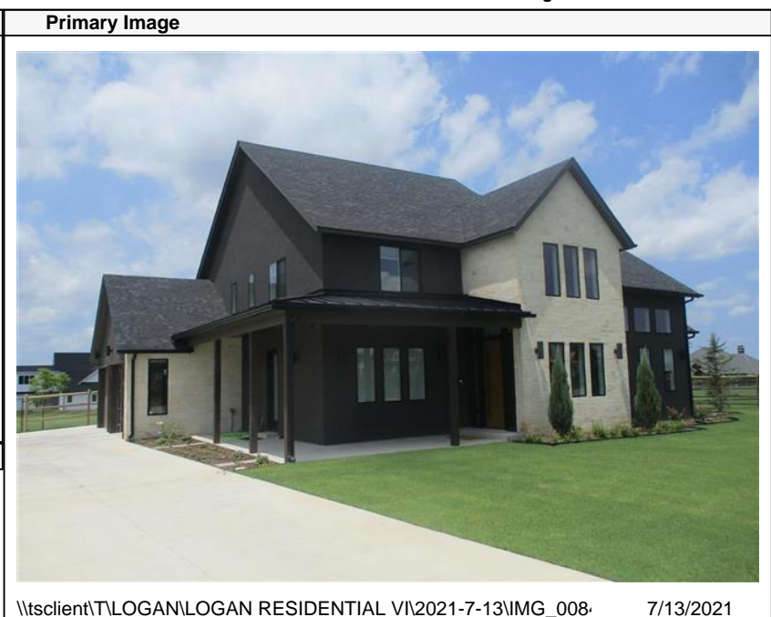
\\tsclient\T\LOGAN\LOGAN RESIDENTIAL VI\2021-7-13\IMG_008 7/13/2021