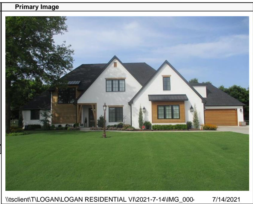
\\tsclient\T\LOGAN\LOGAN RESIDENTIAL VI\2021-7-14\IMG_000 7/14/2021