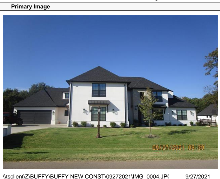
\\tsclient\Z\BUFFY\BUFFY NEW CONST\09272021\IMG_0004.JPG 9/27/2021