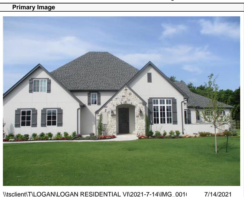
\\tsclient\T\LOGAN\LOGAN RESIDENTIAL VI\2021-7-14\IMG_001 7/14/2021