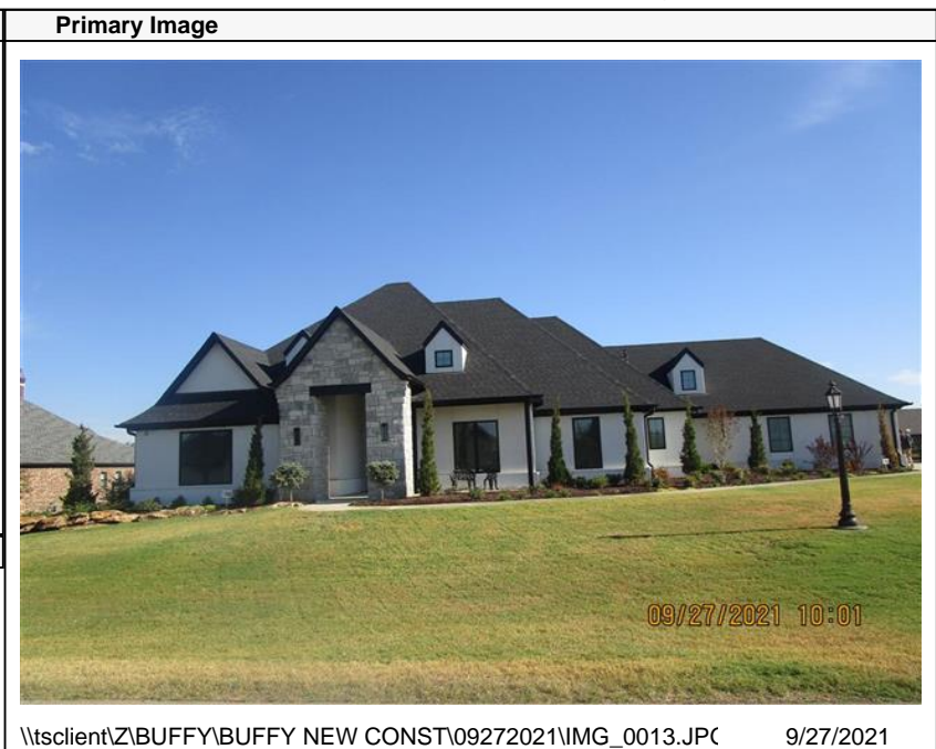
\\tsclient\Z\BUFFY\BUFFY NEW CONST\09272021\IMG_0013.JPG 9/27/2021