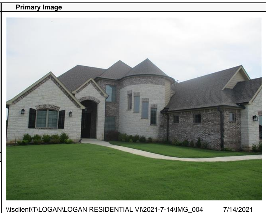
\\tsclient\T\LOGAN\LOGAN RESIDENTIAL VI\2021-7-14\IMG_004 7/14/2021