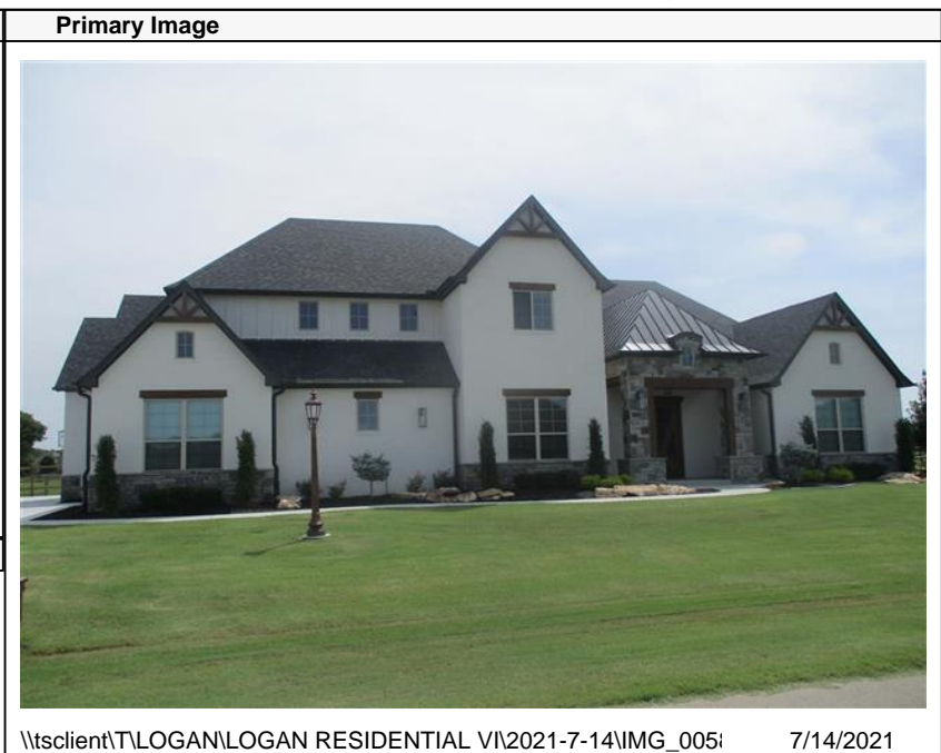
\\tsclient\T\LOGAN\LOGAN RESIDENTIAL VI\2021-7-14\IMG_005i 7/14/2021