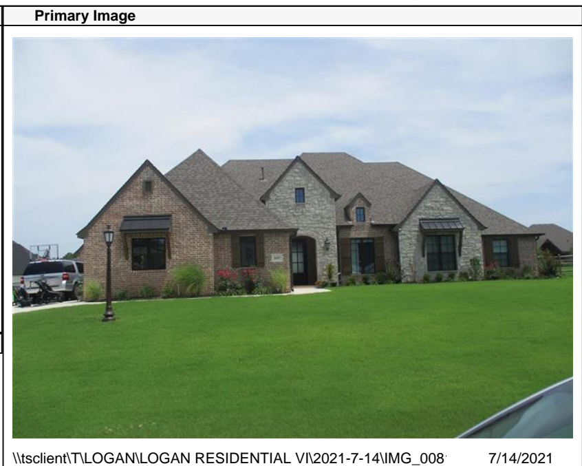
\\tsclient\T\LOGAN\LOGAN RESIDENTIAL VI\2021-7-14\IMG_008 7/14/2021