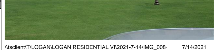
\\tsclient\T\LOGAN\LOGAN RESIDENTIAL VI\2021-7-14\IMG_008 7/14/2021