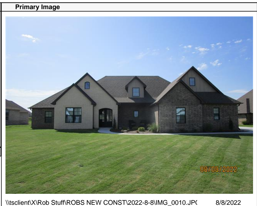
\\tsclient\X\Rob Stuff\ROBS NEW CONST\2022-8-8\IMG_0010.JPG 8/8/2022