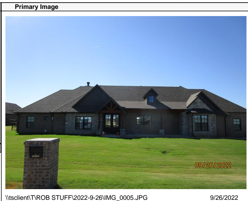
\\tsclient\T\ROB STUFF\2022-9-26\IMG_0005.JPG 9/26/2022