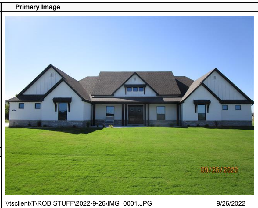
\\tsclient\T\ROB STUFF\2022-9-26\IMG_0001.JPG 9/26/2022