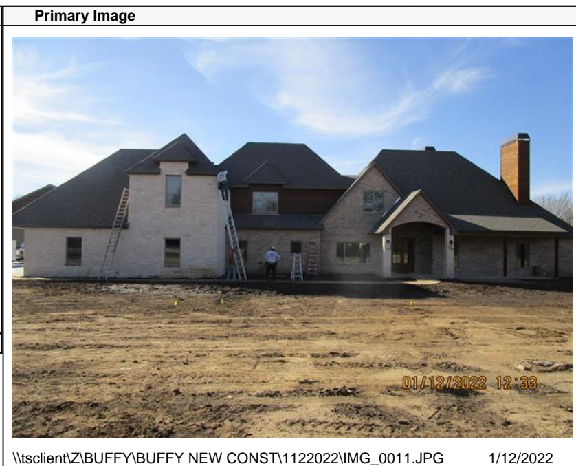
\\tsclient\Z\BUFFY\BUFFY NEW CONST\1122022\IMG_0011.JPG 1/12/2022