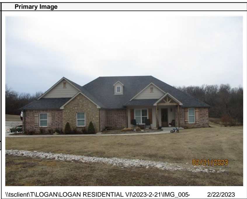
\\tsclient\T\LOGAN\LOGAN RESIDENTIAL VI\2023-2-21\IMG_005 2/22/2023