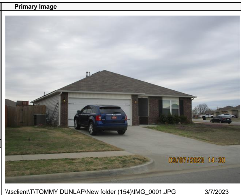
\\tsclient\T\TOMMY DUNLAP\New folder (154)\IMG_0001.JPG 3/7/2023