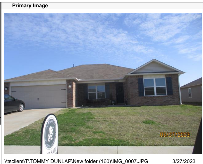
\\tsclient\T\TOMMY DUNLAP\New folder (160)\IMG_0007.JPG 3/27/2023