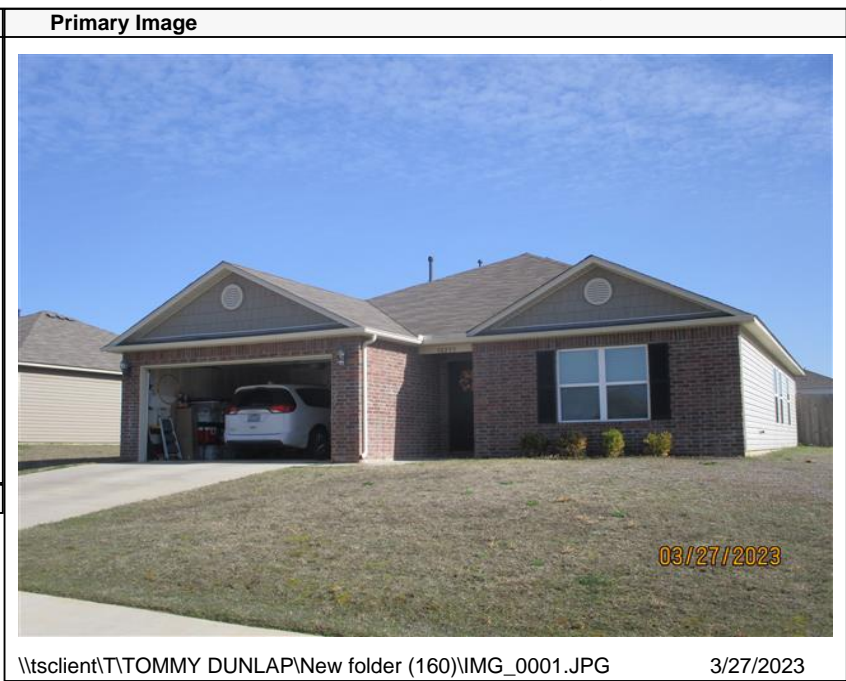
\\tsclient\T\TOMMY DUNLAP\New folder (160)\IMG_0001.JPG 3/27/2023