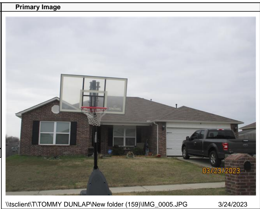
\\tsclient\T\TOMMY DUNLAP\New folder (159)\IMG_0005.JPG 3/24/2023