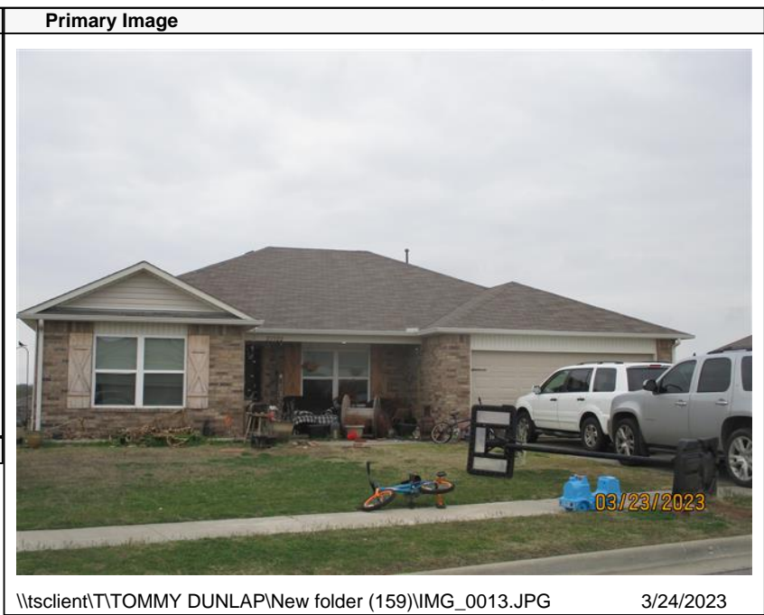
\\tsclient\T\TOMMY DUNLAP\New folder (159)\IMG_0013.JPG 3/24/2023