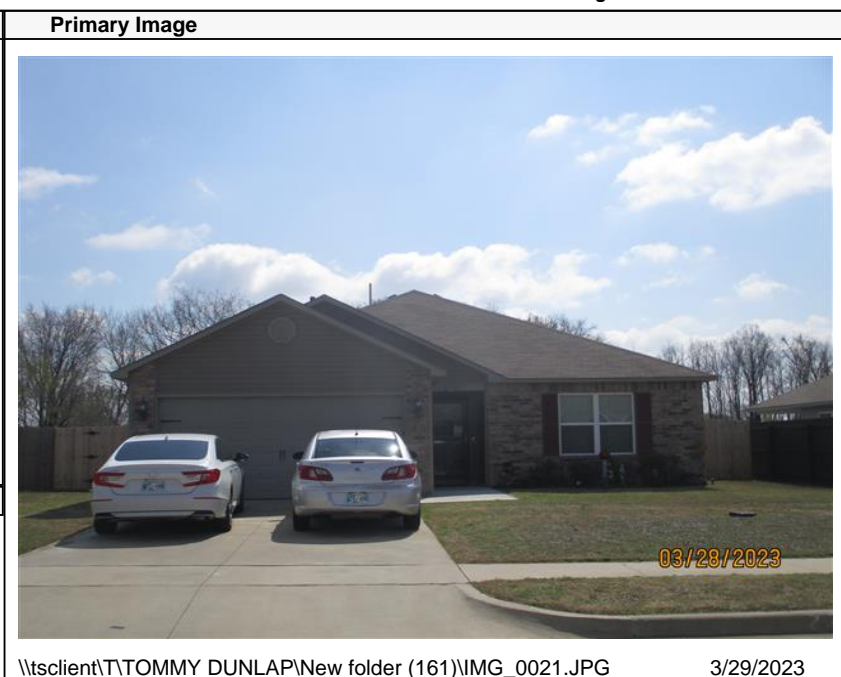
\\tsclient\T\TOMMY DUNLAP\New folder (161)\IMG_0021.JPG 3/29/2023