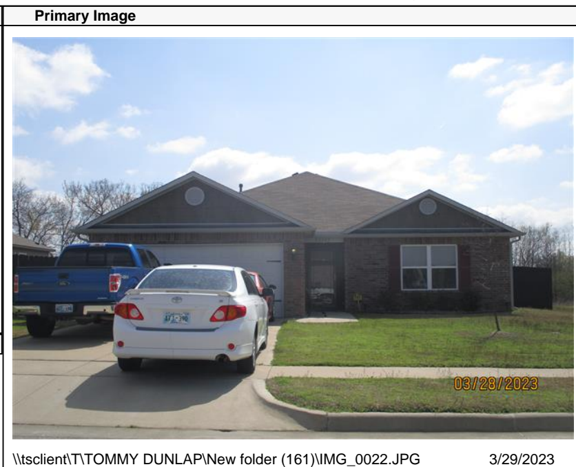
\\tsclient\T\TOMMY DUNLAP\New folder (161)\IMG_0022.JPG 3/29/2023