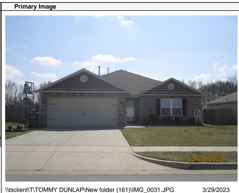
\\tsclient\T\TOMMY DUNLAP\New folder (161)\IMG_0031.JPG 3/29/2023