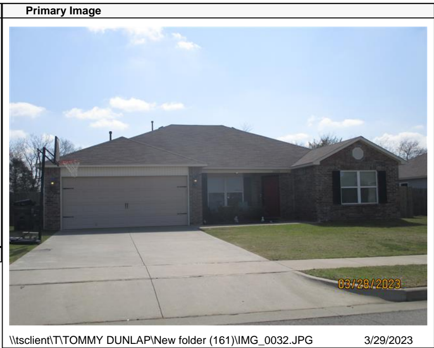
\\tsclient\T\TOMMY DUNLAP\New folder (161)\IMG_0032.JPG 3/29/2023