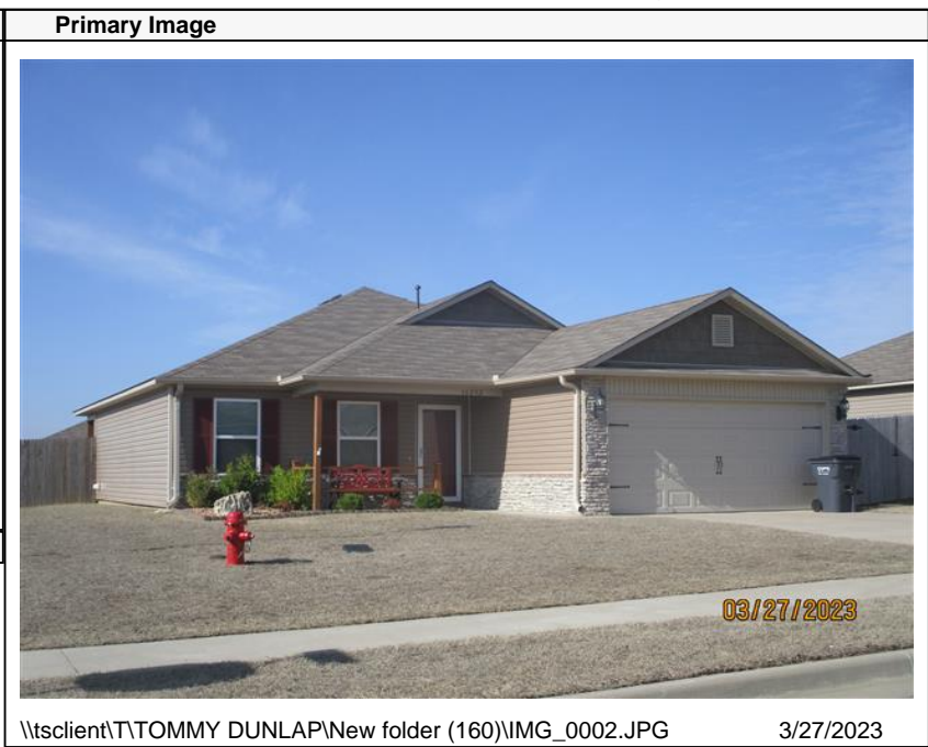
\\tsclient\T\TOMMY DUNLAP\New folder (160)\IMG_0002.JPG 3/27/2023