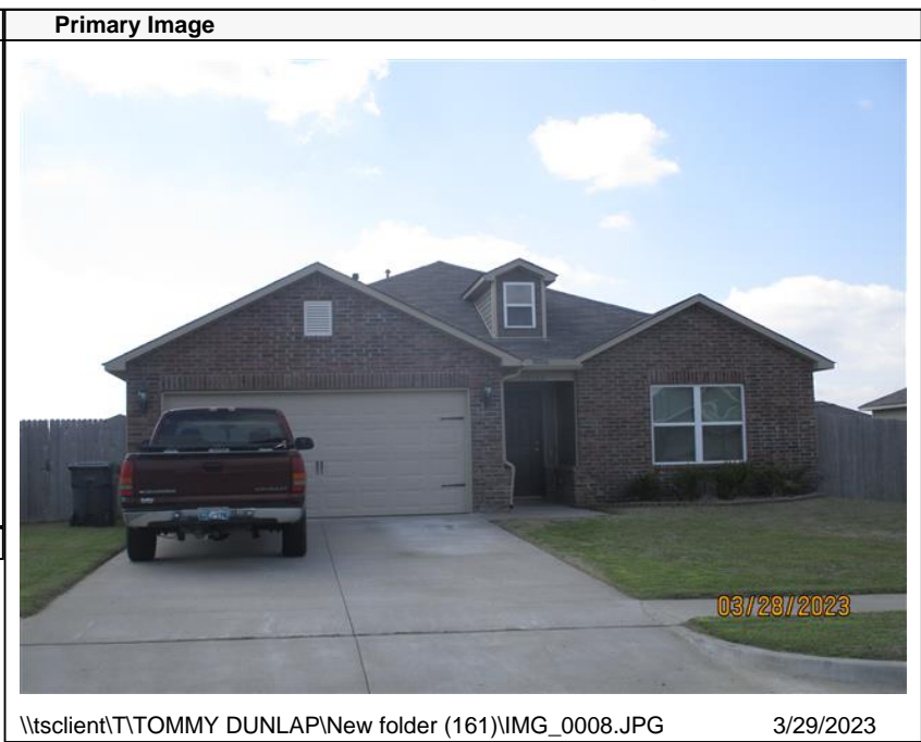
\\tsclient\T\TOMMY DUNLAP\New folder (161)\IMG_0008.JPG 3/29/2023