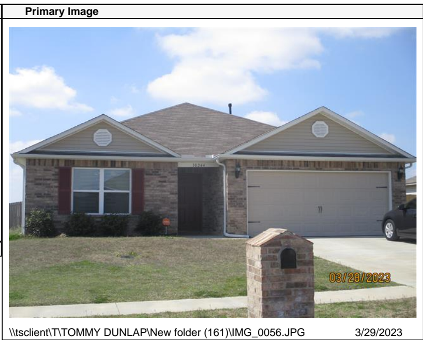
\\tsclient\T\TOMMY DUNLAP\New folder (161)\IMG_0056.JPG 3/29/2023